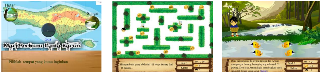
Figure 3. Example of Playing Environment in a Educational Game

In the meantime, at implementation phase, animation and game development are conducted using Adobe Flash CS 5 and ActionScript 2.0. Thereafter, game is tested using blackbox software testing method and software is tested at SDN Lowokwaru 3 - Malang with a sample consisting of 30 students.