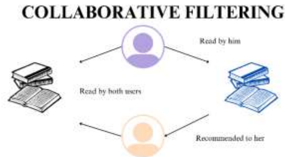
Fig. 3 Collaborative filtering process diagram

interact with one another. For example, in a book recommendation system, high-level design may specify modules such as the user interface, recommendation engine, and database administration. This stage ensures that the system's structure is consistent with its goals, outlining what each component performs and how they operate together. In contrast, low-level design focuses on the smaller aspects of execution. It outlines the technical components of the system, including algorithms, data structures, programming languages, and logic. Low-level design, for example, might describe how user preferences will be kept or how collaborative filtering will be applied in the recommendation engine as per show in figure 3. A prototype is produced to help envision the user interface and experience. This phase produces a thorough design document as well as UI/UX prototypes that serve as the foundation for system development, ensuring that the system fulfills both functional and non-functional criteria.