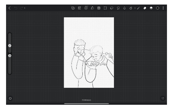
Fig. 12. First Sketch (Culinary)