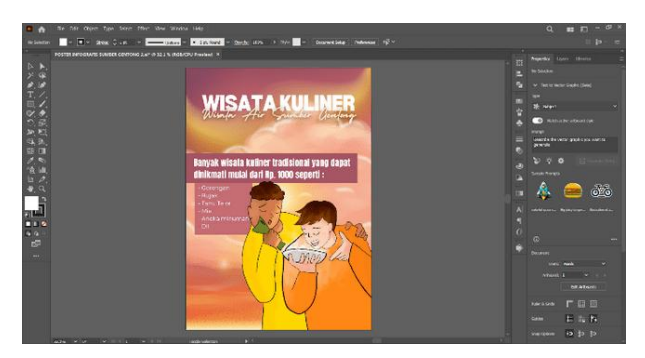
Fig. 20. Digitalization Process (Culinary)