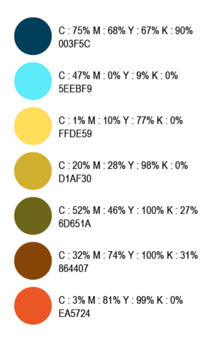
Fig. 2. Color Selection Infographic Natural Tourism Sumber Gentong

The colors chosen are adjusted to the topic or content in the infographic so that they meet the design principles related to harmony and balance. The colors for the infographic are dominated by warm colors. While the colors for the natural potential infographic are dominated by cool colors to create an impression that matches the content of the natural potential infographic. The selection of colors used for the natural potential infographic can be seen in the picture.