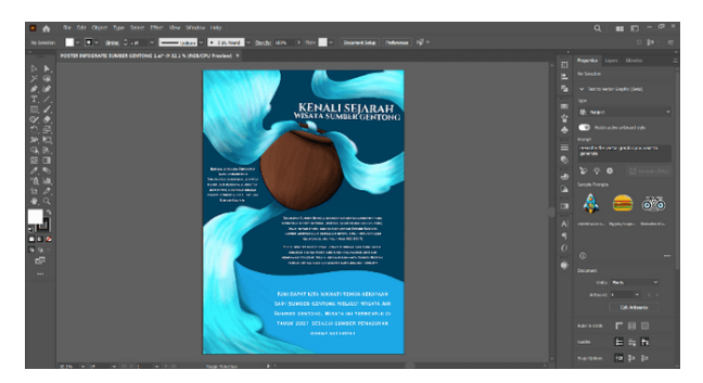
Fig. 19. Digitalization Process (History)