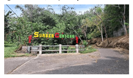
Fig. 1. Entrance to Wisata Alam Sumber Gentong

Sumber Gentong is located on Jalan H. Nur Rois, Tirtomoyo Village, Pakis District, Malang Regency, East Java. This location can be easily reached from the center of Malang City in about 30 minutes. To get there, visitors can follow the route from the Al Ishlah Jami Mosque in Gentong Hamlet, then turn north and follow the directions to Gapura Abdillah Gang 4. After that, the journey continues west until arriving at Sumber Gentong.