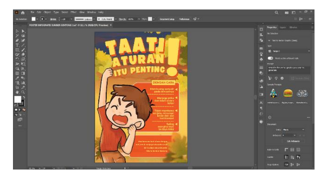
Fig. 21. Digitalization Process (Rules)