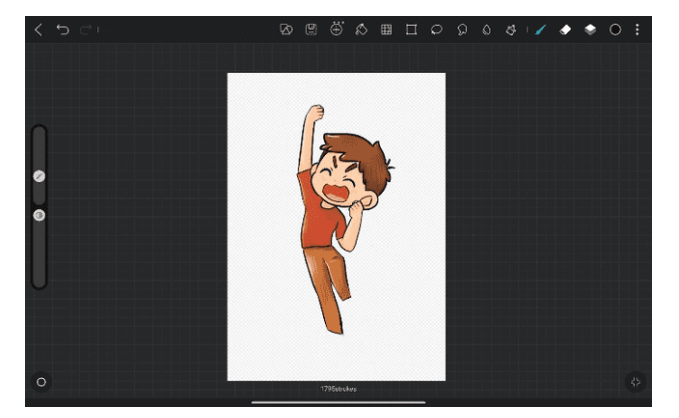
Fig. 17. Illustration Process (Rules)