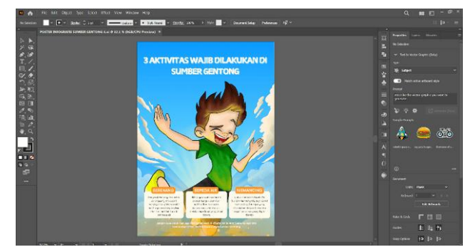
Fig. 22. Digitalization Process (Activity)