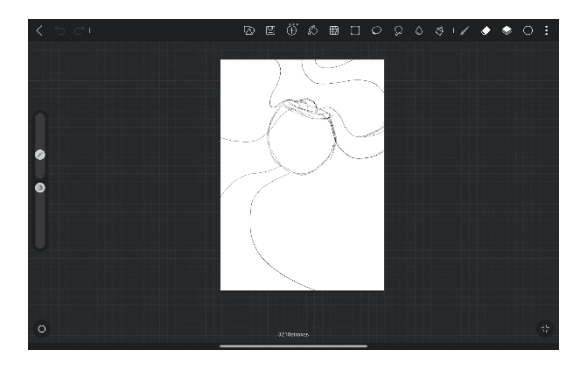
Fig. 11 First Sketch (History)

In the pre-production process, the initial sketching process is carried out. The initial sketch is the process of finding a visual form that is a reference for the information media that is created. The sketching process refers to the image that will later be made to facilitate the visual concept that will be used.