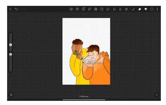
Fig. 16. Illustration Process (Culinary)