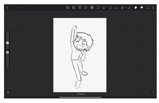
Fig. 13. First Sketch (Rules)