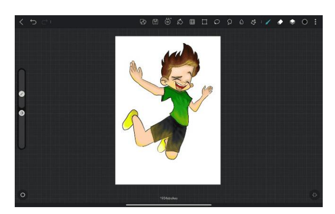
Fig. 18. Illustration Process (Activity)

In this process, manual sketches are used as a reference for the illustration digitization process. Here the infographic digitization process uses the Hipaint application. This illustration will be used as a decoration to make it look attractive to visitors to Sumber Gentong Nature Tourism.