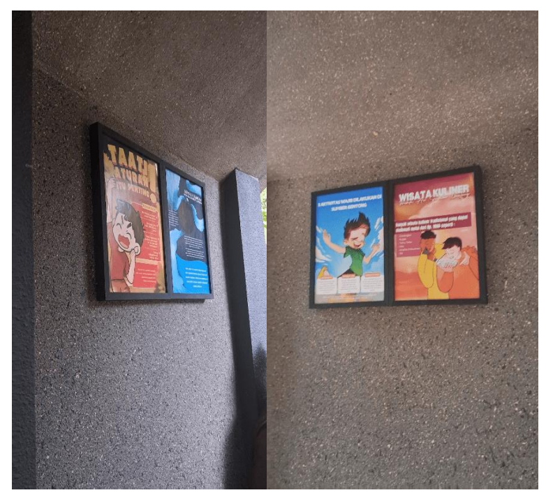
Fig. 23. Infographic poster application & Digitalization Process (Activity)

This infographic poster is installed at the entrance gate of Sumber Gentong Nature Tourism due to the limited installation area in the tourist location which is dominated by an open environment. This placement was chosen so that visitors can easily see important information after purchasing tickets before entering the tourist area. To provide a more attractive and maintained appearance, the infographic poster is also equipped with a figure.