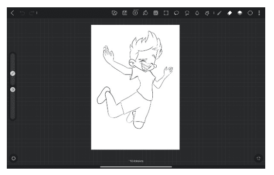
Fig. 14. First Sketch (Activity)

In the picture, the illustration design for the Sumber Gentong Nature Tourism infographic poster is shown. This illustration will later be used as a decoration for the infographic that is made.