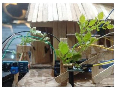
Fig 4. Laser alarm circuit

The creation of the Arduino Uno-based laser alarm circuit is made according to Fig. 2. At this stage, the laser light will directly face the LDR sensor so that the LDR sensor receives light from the laser lamp. The buzzer will be activated when the LDR sensor does not receive light from the laser lamp.